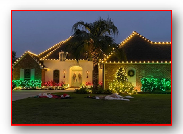
18333 Oak Lane Ave.