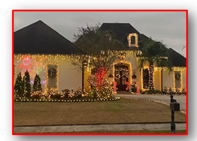
17720 Shady Elm Ave.