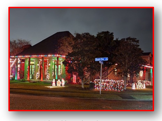
17637 Shady Elm Ave.