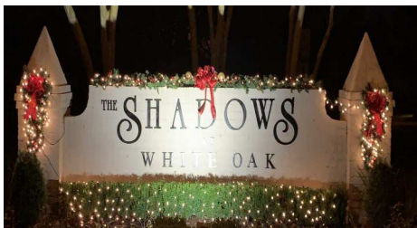
Shadows At White Oak

Two neighborhood boy scouts were recently hired to clean the entrance signs at Shadows at White Oak and Shadows Lake. Pictured below are Jefferson and Emerson Ricketts. The signs were in need of a good scrubbing and the boys did a great job!