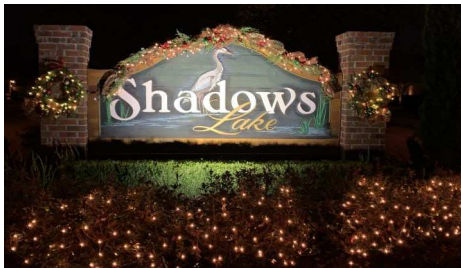
Shadows Lake Entrance Two