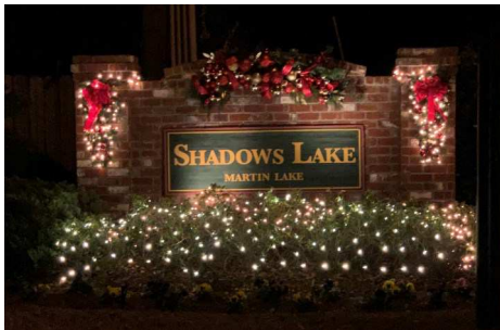
Shadows Lake Entrance One

Flowers have also been planted and our entrances are ready to enjoy for the fall/winter season!