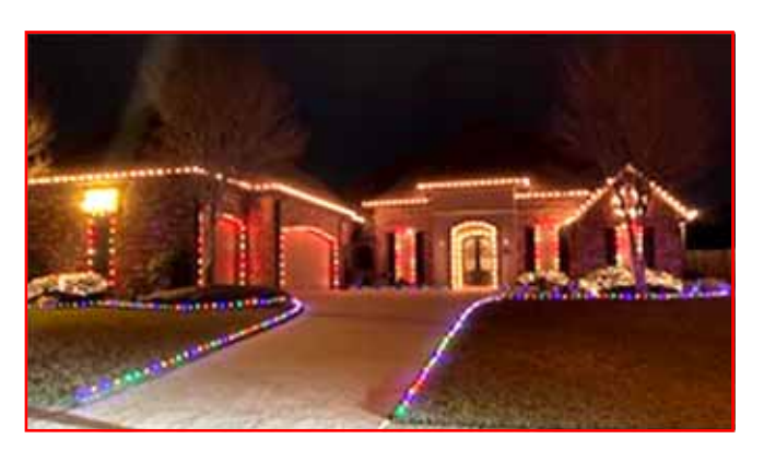
17627 Shady Elm