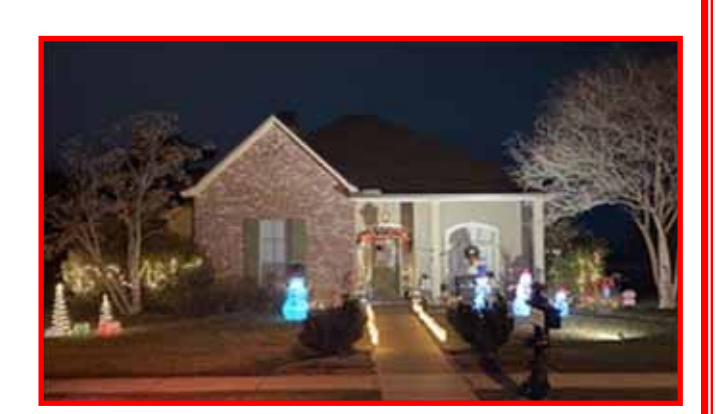
18341 Shadows Creek

*All winners received a $50 gift card to Lowe's.