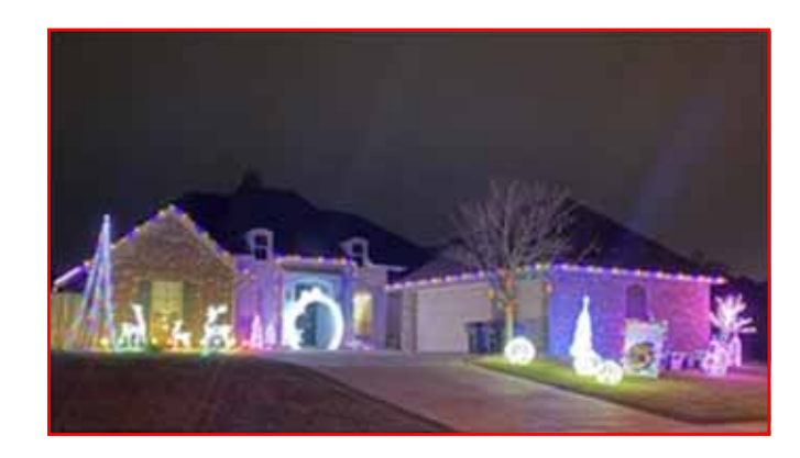
17752 Shady Path

Thanks to all of our neighbors for the festive lighting and decoration displays!